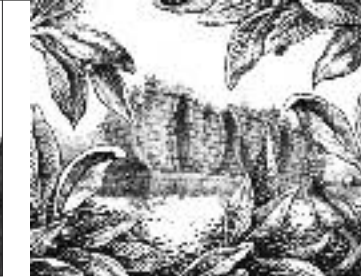
Fiduciary Remains No. 3, 2007