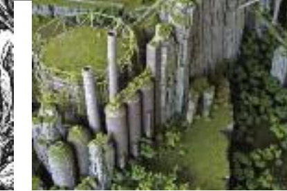
Zenith (detail), 2008

son was born and someone gave him a U.S. map puzzle. That started me thinking: fears of globalization, the French headlines after September 11 th saying “We are all Americans,” the Coalition of the Willing. It all fell together—we’ll just redraw the world map. That sort of big, absurd idea really appeals to me.