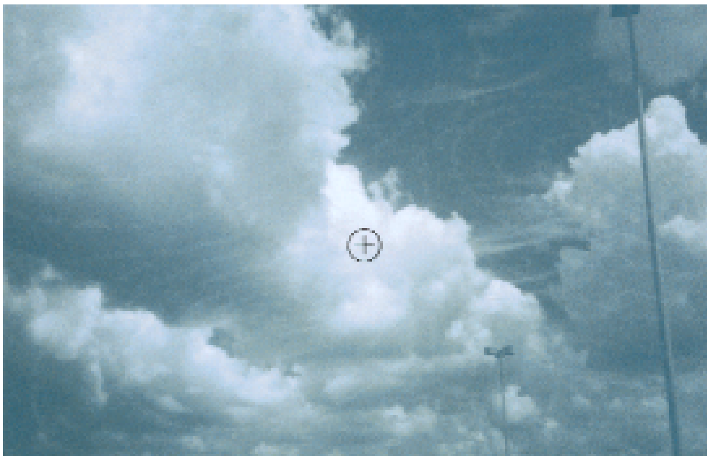
Sandra Wimer Target Sky I , 2001 Giclée print 28 x 41 inches