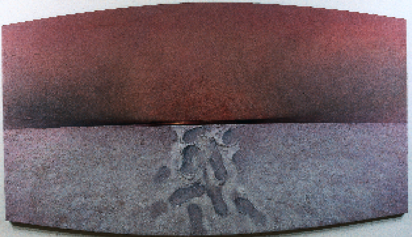
Serdar Arat Footprints in the Snow , 1998 Acrylic on linen 48 x 84 inches