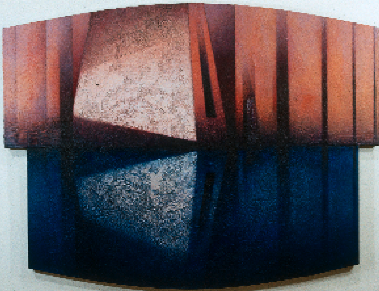
Serdar Arat Island , 2002 Acrylic on linen 51 x 68 inches